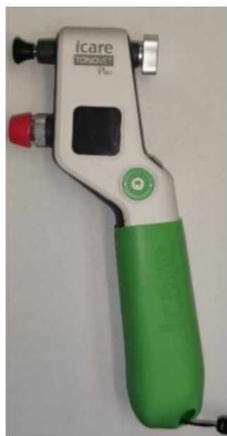
Figure 4. TonoVet®