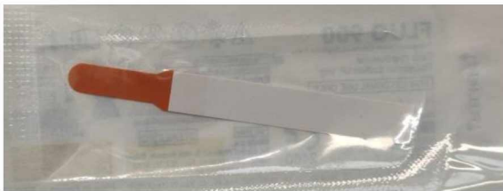
Figure 5. Sterile fluorescein impregnated paper strip

fluorescein on the cornea which can lead to false positive result, also because of higher propensity to bacterial contamination (especially from Pseudomonas species) (HEINRICH, 2014; KERN, 1990). To implement the fluorescein test, the strip is wetted with sterile saline and applied to the conjunctiva of the dorsal fornix without touching the cornea directly as it may lead to false positive. The eyelids are blinked forcibly to distribute the dye on corneal surface (HEINRICH, 2014). As a solution, fluorescein is administered as single use vial at concentration of 0.5% directly on the cornea. The eyelids are again forcibly blinked to distribute fluorescein solution over the cornea. The cornea is then thoroughly rinsed with physiological serum to avoid false positive results (FAMOSE, 2018).