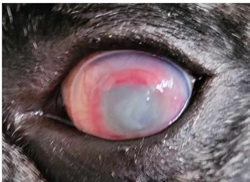
Figure 9. Example of keratomalacia

Melting ulcers, or keratomalacia, happen when proteinase inhibitors are overwhelmed by a high presence of activated proteinases usually due to producing microorganisms and inflammatory cells (TSVETANOVA et al., 2021; SANCHEZ, 2014). This type of complication is usually presenting with paste-like, sticky irregular edges of the lesion with white to yellow cellular infiltrates according to cause (MILTCHALIEV, 2022; SANCHEZ, 2014). Even though the appearance of keratomalacia is pathognomonic (TSVETANOVA et al., 2021), its diagnosis should be based on revealing the loss of epithelium accompanied by stromal liquefaction and the presence of cellular infiltrates and corneal edema (ION et al., 2015). As usual, fluorescein test should be performed. In the case of keratomalacia, the hydrophilic dye will stain the degenerative stroma on large areas of the cornea and the ulcer will stain strongly. Care should be taken to rinse thoroughly the lesion and evaluate presence or not of staining at the bottom of the crater-like lesion to avoid the misdiagnosis of a descemetocoele (HEINRICH, 2014; ION et al., 2015).