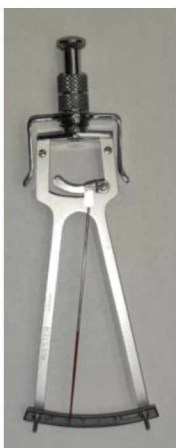
Figure 2. Schiøtz tonometer (source: archives of Clinic for Surgery, Orthopedics and Ophthalmology, Faculty of Veterinary Medicine University of Zagreb)

Indentation tonometry can be performed by applying Schiøtz tonometer (cf. Figure 2) with a standard force to the cornea. Indentation tonometers rely on gravity for an accurate reading and should be placed vertically on horizontal placed corneal surface. Due to restraint of patient and the awkward head positioning, it is very difficult to perform it on small animals, plus ocular rigidity can vary a lot in dogs and influence accuracy of measurement. (MAGGS, 2008a). Tono-pen ® (cf. Figure 3) and TonoVet ® (cf. Figure 4) tonometers are both used in everyday practice (LEWIN, 2021). Advantages of the Tono-pen include the ease of use, the accuracy, the head of the patient does not need to be held vertically and so repeated measurements are easier to take, the probe tip is small so it can be covered with a disposable latex cap and it can be applied to non-diseased part of the cornea, also IOP is directly displayed in mmHg on the instrument. Applanation tonometry relies on that force required to flatten surface of a sphere is equal to the pressure inside the sphere. It is performed by gently touching corneal surface with the tip of the instrument through multiple light ‘blotting’ movements.