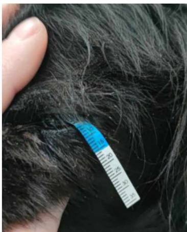
Figure 1. Schirmer tear test

STT is a semiquantitative method to measure production of the aqueous part of tear film (MAGGS, 2008a, LEWIN, 2021). The test is performed with sterile, individually packed paper strips with a 5mm notch on one end used as a mark to fold the strip and hook it at middle to lateral third of lower eyelid for a minute to avoid protection of cornea from third eyelid (cf. Figure 1). There are three types of Schirmer tear tests. STT-1 is the most commonly used and is performed without topical anesthetics. It measures the trigeminal reflex tearing added to physiological secretion (OLLIVIER et al., 2008). Normal STT-1 values in dog are 12-25 mm/min. STT-2 (OLLIVIER et al., 2008) is similar to STT-1 except that cornea and conjunctiva will be topically anesthetized to estimate only basal secretion of tears. It is usually only used in experimental settings. STT-3 can be done with or without topical anesthesia, but its main characteristic is that there is simultaneous stimulation of the nasal mucosa with an alcohol soaked cotton to maximize reflex tearing. It is commonly named nasolacrimal reflex as lacrimation is stimulated through ocular surface reflex but also activation of trigeminal innervation (IWASHITA et al., 2023; TSUBOTA, 1991). A faster method for assessment of tear production is the Phenol Red Thread. This test is thought to be more accurate than STT because it causes minimal stimulation of tear production for a shorter time (BROOKS, 2005a).