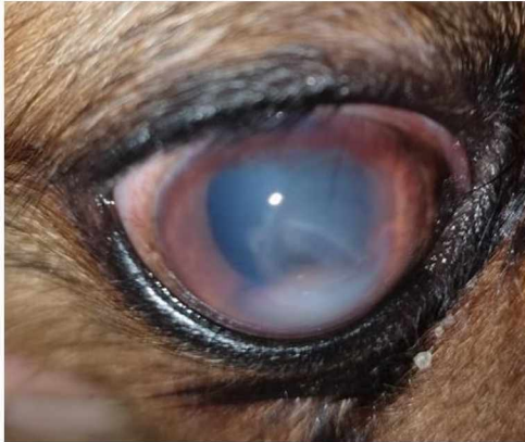
Figure 8. Hypopyon