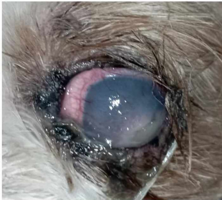
Figure 7. Infected stromal ulcer

Diagnostic procedure should then be completed with a STT-1 test and fluorescein staining to precisely visualize the extent of damage. In stromal ulcers, infected or not, fluorescein will penetrate through initial epithelial and stromal lesion and will diffuse into area of the cornea where epithelium is intact, it will give a gradually fainting green color to the corneal stroma surrounding the primary defect (HEINRICH, 2014).