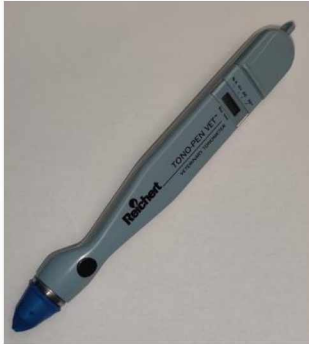
Figure 3. Tono-pen®