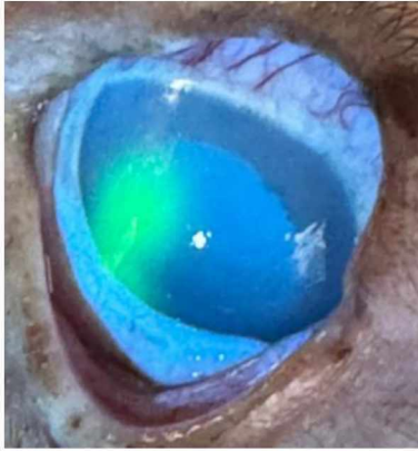
Figure 6. Halo effect in Indolent ulcer