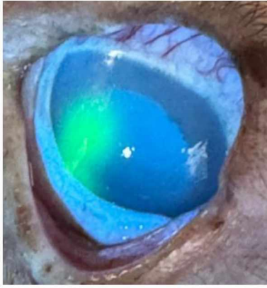
Figure 6. Halo effect in Indolent ulcer