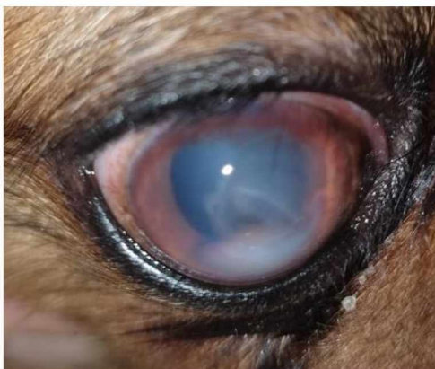
Figure 8. Hypopyon